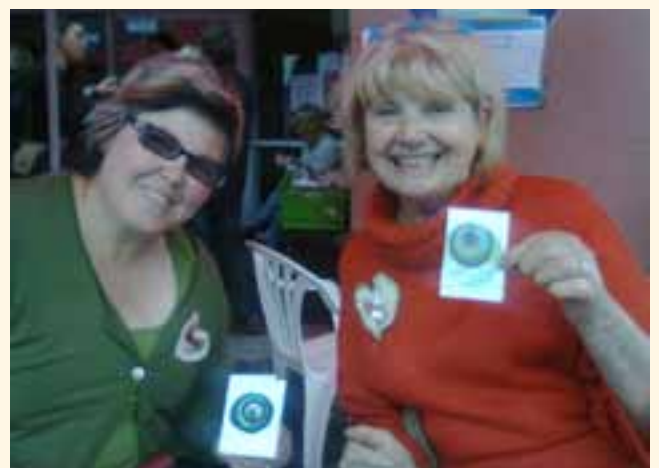
Happy Lyttelton residents receive art therapy postcards via the Postcard Project.