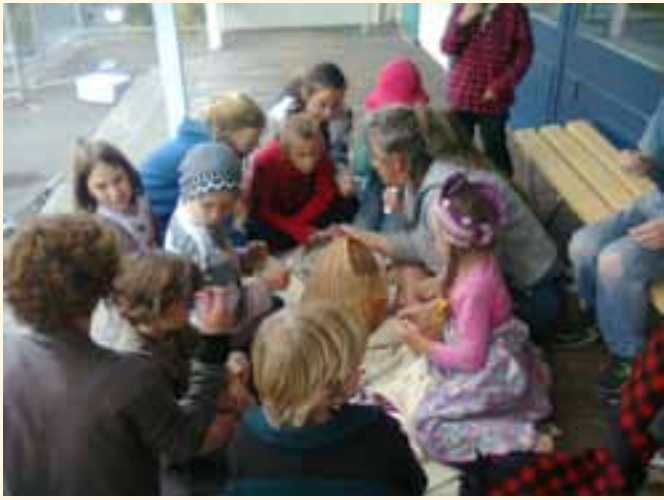
Lyttelton West participating in the Hearts Therapy Project.

and at Lyttelton West School, opened the door for further school-based arts therapy activities. Each class group at Lyttelton West participated in creating an artwork entitled