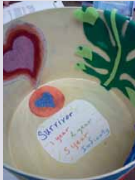
This intention box created by a group of women whose lives were touched by cancer contains elements showing their feelings for one another as well as their intentions for their lives.

Today, she works with children in schools, as well as adults in psychiatric care and in wellness programs, like the work